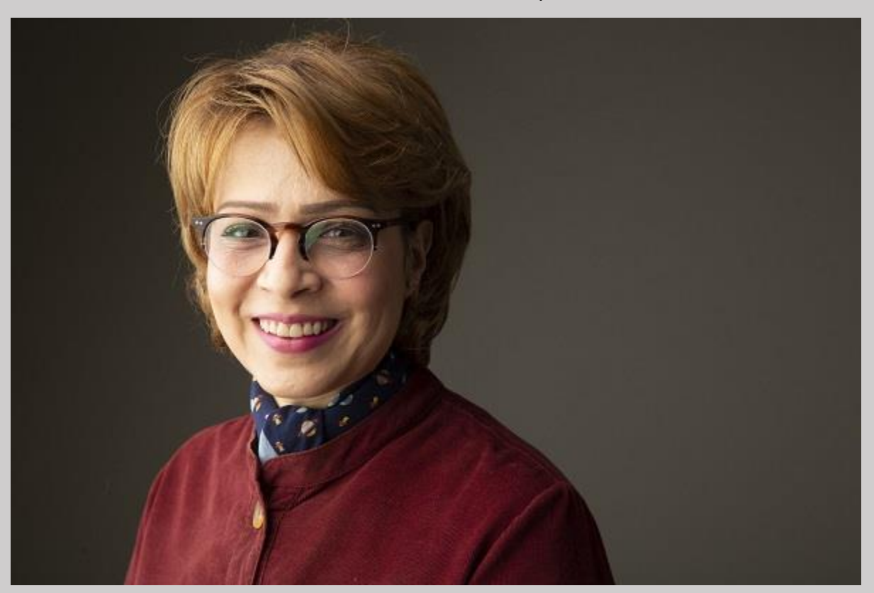
An Autistic Heroine Who Puts the Impossible to Shame

Few know about her struggle with Asperger's Syndrome and how she defeated all odds in her ability, overcoming massive challenges.